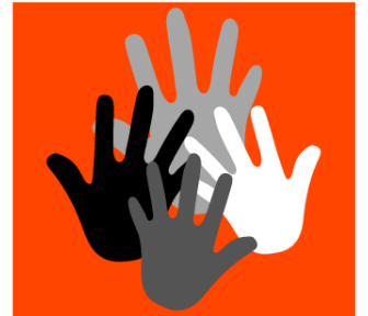
RACIAL JUSTICE & EQUALITY