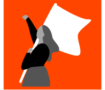
GENDER EQUITY & EMPOWERMENT

Providing services for survivors and their loved ones impacted by sexual violence. Enhancing the well-being of families, especially children and seniors by fostering social connections, offering child care and summer camp experiences.