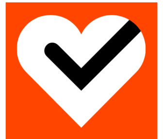
SAFETY, SUPPORT & WELLNESS